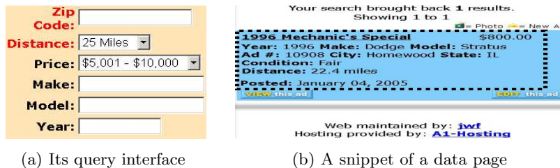
Fig. 1: A car sale Web site: query interface and data page

incremental learning of domain ontologies for semantically marking up the Web services. DeepMiner is motivated by the following observations. First, we observe that many sources, which may potentially provide Web services, typically have already been providing similar services in their Web sites through query interface (e.g. in HTML form) and Web browser support. To illustrate, consider buying a car through a dealership’s Web site. The purchasing may be conducted by first specifying some information on the desired vehicle such as make, model, and pricing, on its query interface (Figure 1.a). Next, the source may respond with the search result, i.e., a list of data pages (e.g., Figure 1.b), which typically contain detailed information on the qualified vehicles. The user may then browse the search result and place the order on the selected vehicle (e.g. through another HTML form).